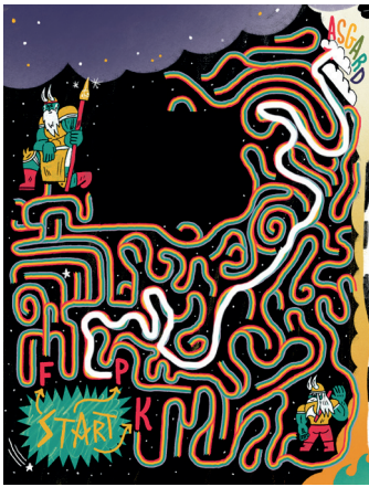
PUZZLE 1 Broken Bifrost