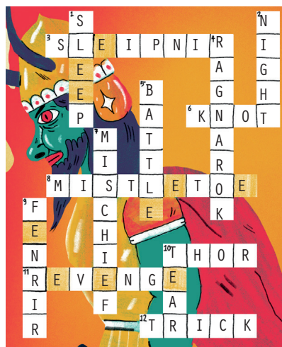
PUZZLE 5 Loki's ludicrousness