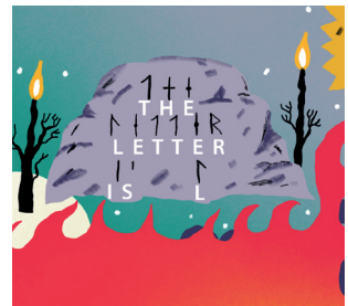
PUZZLE 3 A runes of Alheimir